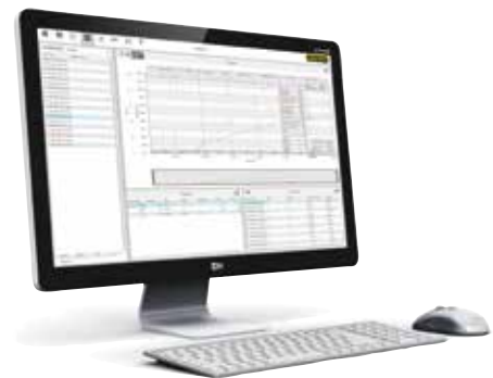
VCD Software for Control, Visualisation and Documentation